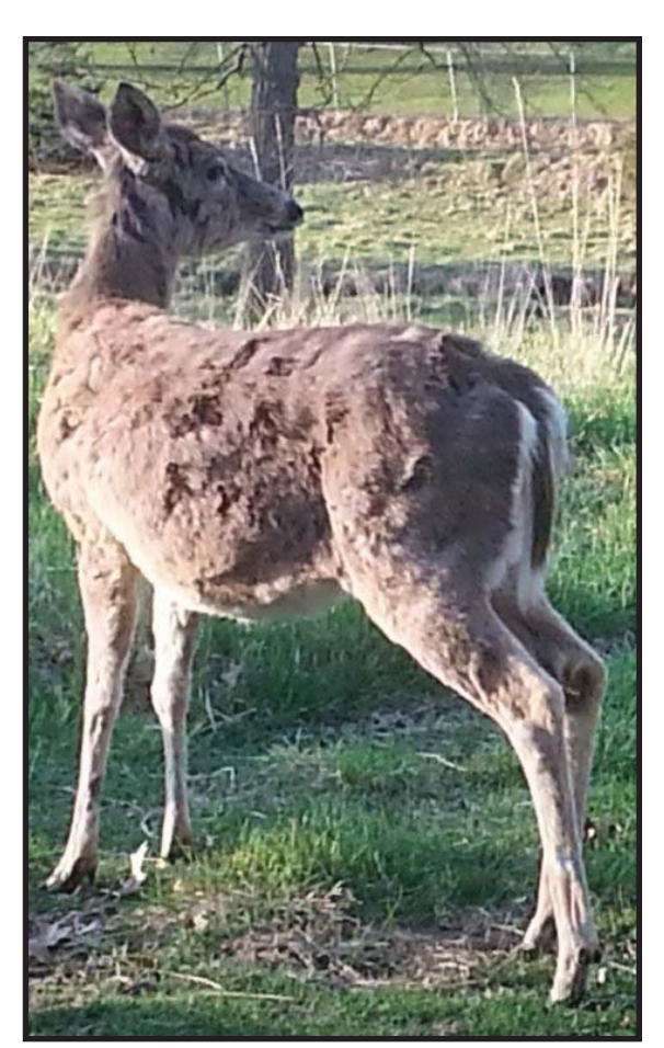
Ragged deer coat in Lords Park Zoo

The animals look a little ragged now. A little ruffed up and worn out. Patches of fur are missing here and there. A day will come when standing in a shaft of sunlight