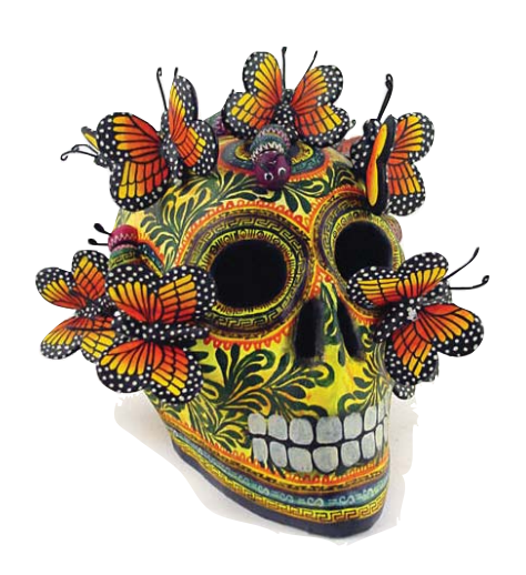
Day of the Dead Skull Mexican lore claims monarchs are the souls of dead relatives returning during Day of the Dead.

the seasonal visitors. Monarchs huddle together to keep warm through winter storms in a semi-dormant state, sometimes waking in warmer bursts to search for water.