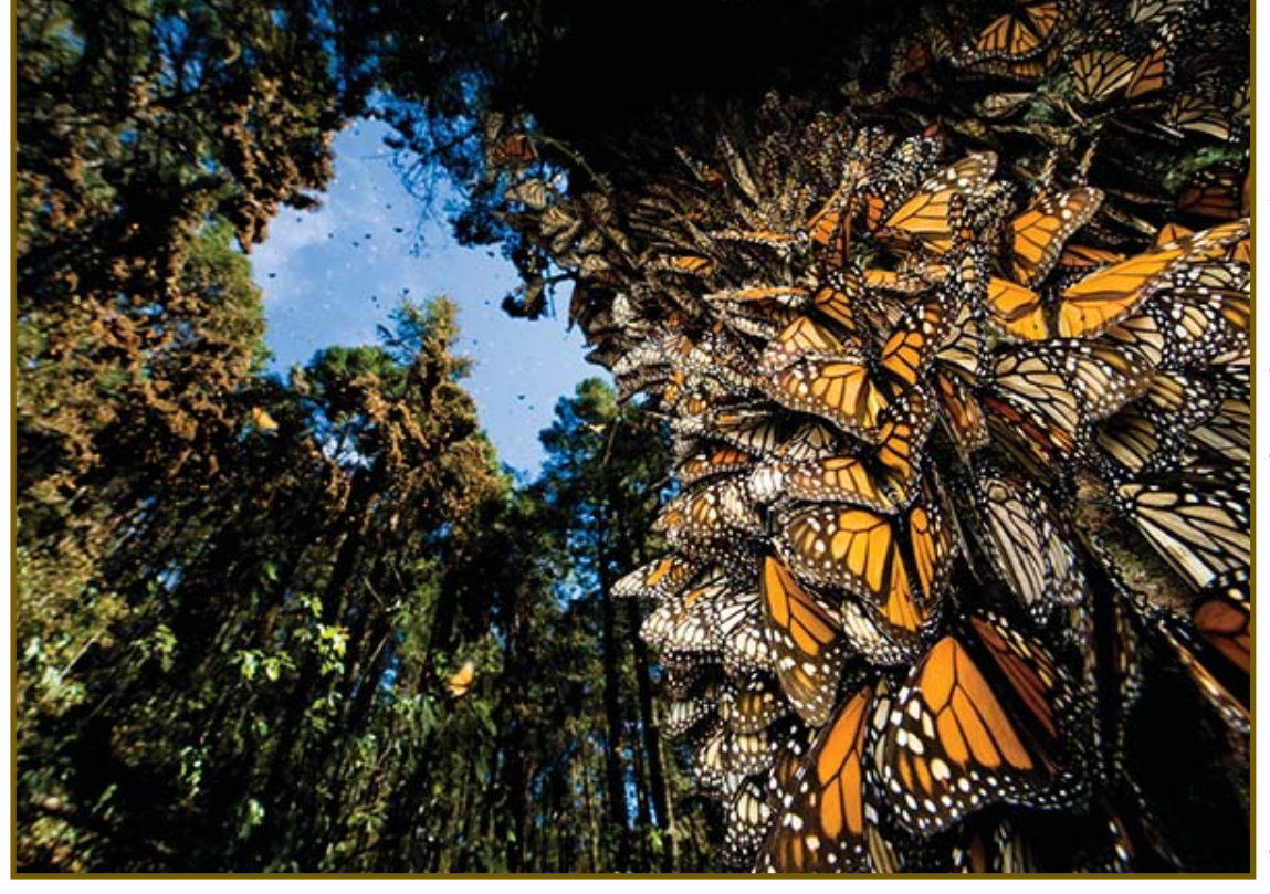
Monarchs overwintering on the oyamel firs of Mexico

Covering the boughs, the butterflies roost on the oyamel firs by the tens of thousands. Even though these are hardy trees, sometimes a branch will break with the weight of