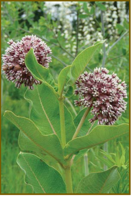
Common Milkweed can be seen in the Savannah Garden by the Museum and in the deer & elk pens of the Zoo in Lords Park.

people to plant milkweeds in their home gardens, parks, and other green spaces. So this spring, consider adding milkweed to your garden as we wait for the monarchs to return.